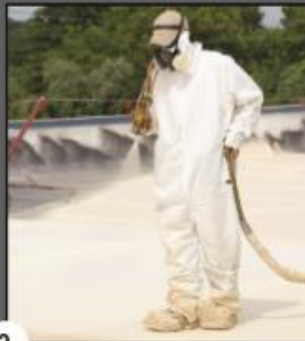
2 Apply SPF with a minimum thickness of one inch.