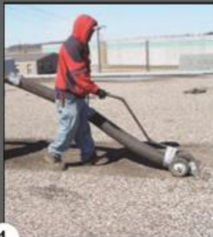
1 Prepare roof surface to specification.